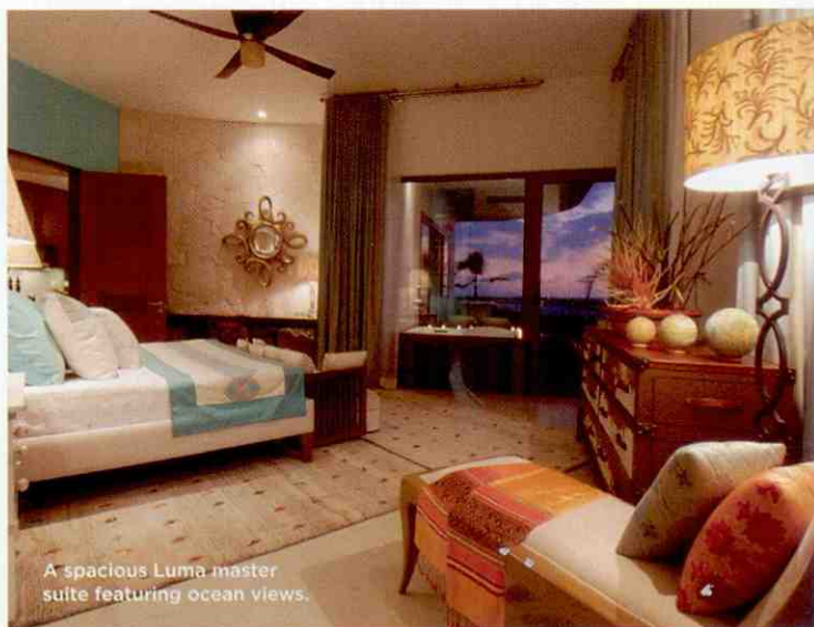
A spacious Luma master suite featuring ocean views.

To the south, in Nuevo Vallarta, the new Pacific coast enclave of LUMA ( www.lumaliving.com ) also beckons travelers to put down permanent tropical roots. Here, 15 minutes beyond the Puerto Vallarta airport, is an American-developed, full-ownership, active adult beachfront community within a master-planned resort. Gracious outdoor spaces, the El Tigre golf course, a lively beach bar and bistro, and saltwater infinity pools are just a few of Luma's amenities. And with one-, two-, and three-bedroom condominiums and penthouses in seven striking 10-story towers, the residences offer expansive views of the ocean and the mountains, irresistible invitations to walk on the beach, boat along the coast, or explore the Mexican countryside. ■